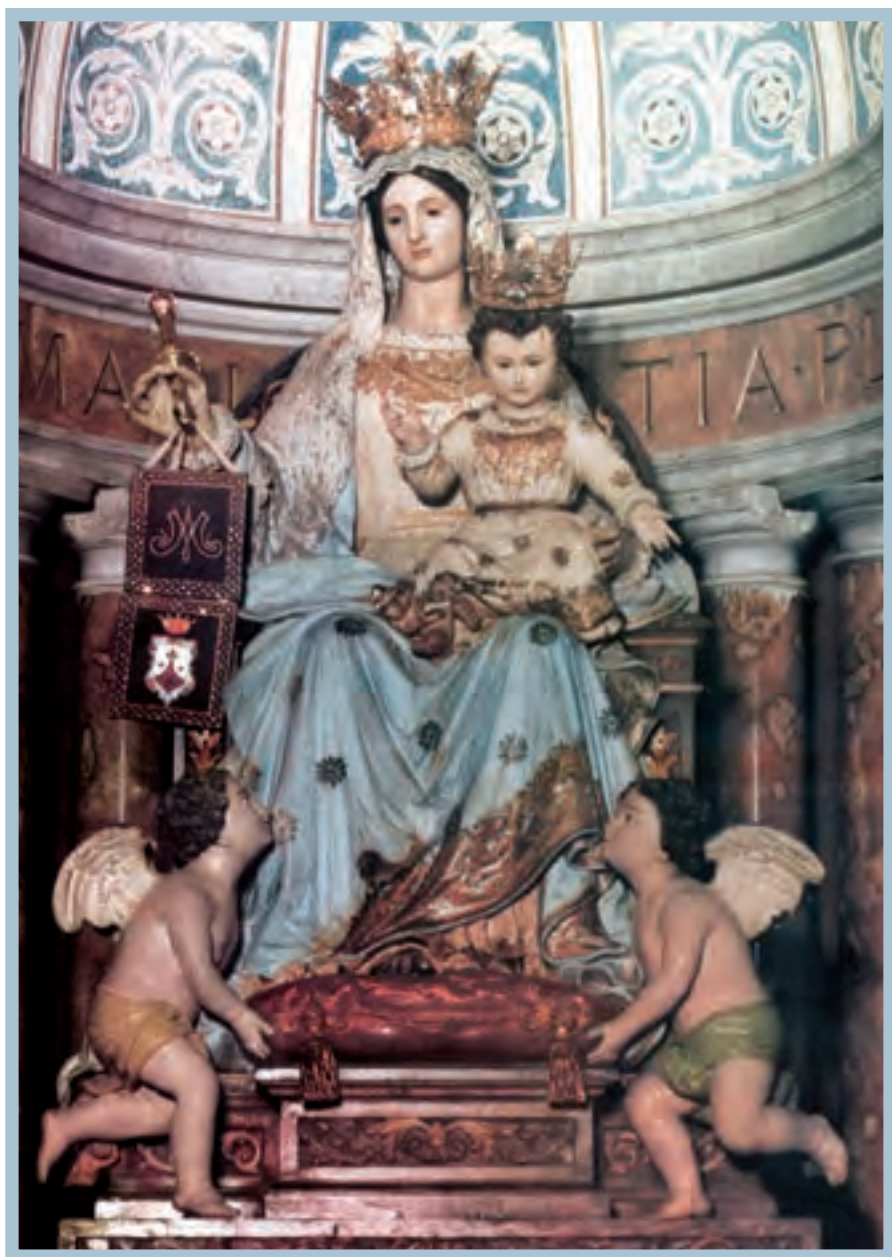
Statue of Our Lady of Mount Carmel in the Church of Our Lady of Mount Carmel on the Via della Conciliazione in Rome, a few hundred yards from Saint Peter's Square.