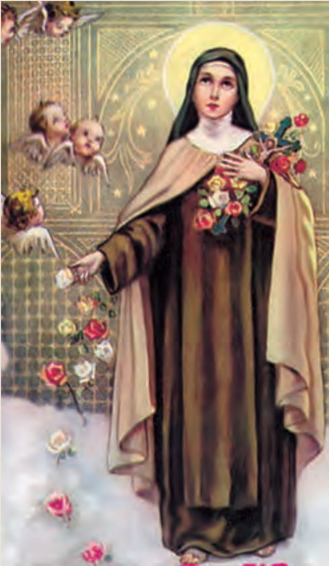
Saint Theresa of Lisieux, the “Little Flower”, a Carmelite nun who died in 1897 at the age of 24, is pictured here wearing the full Scapular of Mount Carmel.